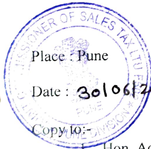
Joint Commissioner of Sales Tax PUN-VAT- F-602, Pune